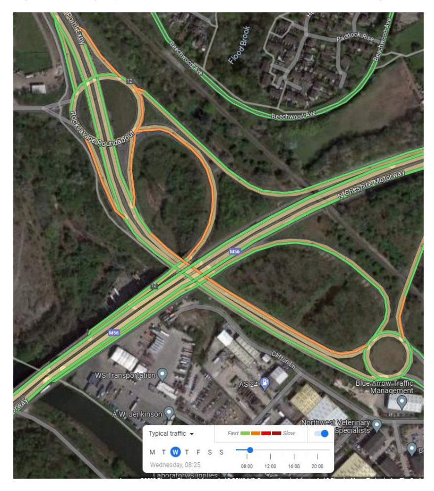
Figure 2 – Google typical traffic A557 southbound, south of Rocksavage Roundabout

Given the comments provided by WSP on the model, it is requested that ADL confirm what they have undertaken to ensure the assessment is representative of network conditions.